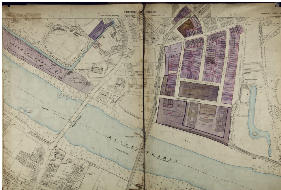
Fulham Estate Map (fragment)

For more background on property holdings, see the Research Guide on Church Property.