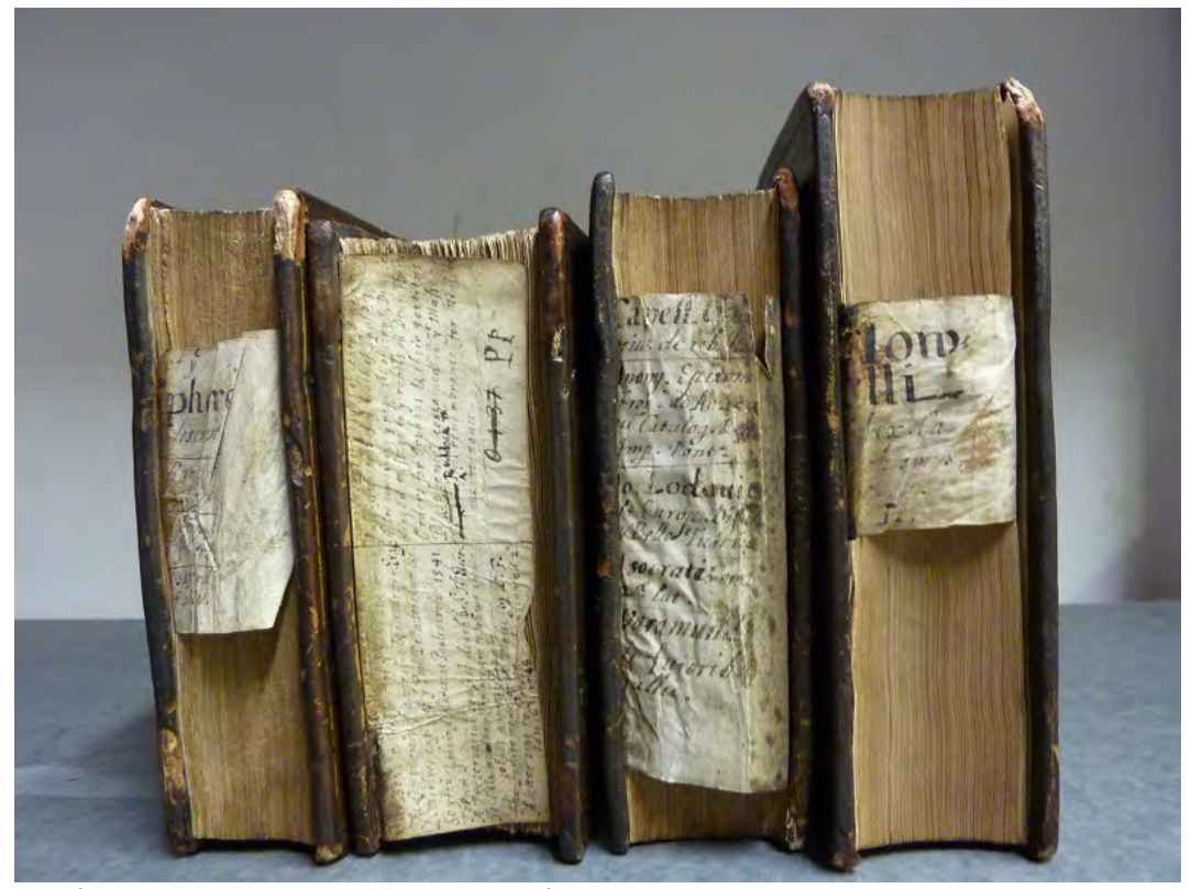
Bancroft books with labels. Modern shelf marks 1550.2, 1553.07, 1573.2, 1573.02

In the case of vellum books of reasonable thickness, the spine offered an alternative writing surface on which to record the author, title, and subject class. These books were shelved amongst the others but with the spine outwards.