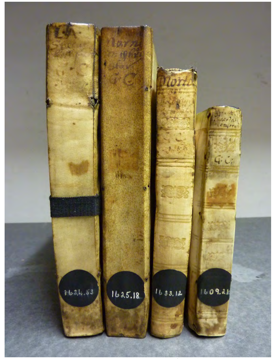
Abbot books with titles on the spine. Modern shelf marks 1624.53, 1625.18, 1633.12, 1609.24

Armorial bindings. On many of his books Abbot employed four stamps displaying his arms as Archbishop of Canterbury, ie. the arms of the See of Canterbury impaling those of Abbot (a chevron between three pears). The stamps are 98x 80mm., 77 x 72mm., 69 x 54mm., and 51 x 44mm. See the British Armorial Bindings database.