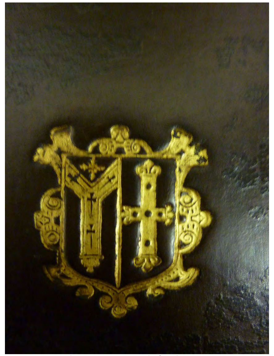
Armorial binding of Archbishop Whitgift. Shelf mark 1604.22