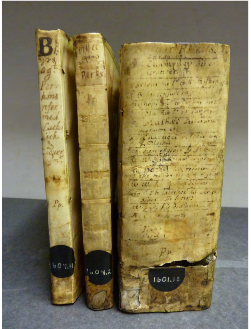
Bancroft books with titles on the spine. Modern shelf marks 1607.11, 1607.21, 1601.13

The vast majority of the manuscripts were rebound by Archbishop Sancroft and have lost characteristic features from the era of Archbishops Bancroft and Abbot. However a fragment of a vellum label attached to the front board of MS 346 appears to be Bancroftian and suggests that, like the printed books, the manuscripts were shelved with the foredge outwards.